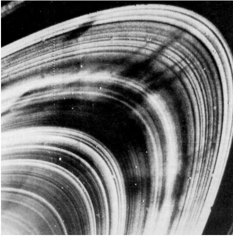
Figure 1. A Voyager image showing the radial spokes (dark streaks) along the rings.

surements can be used to quantify and compare these fluxes. Based on these new observations and simple modeling, we present evidence that the ring top and bottom surfaces change from a negative unipolar electrical configuration at small opening angles to a bipolar (negative-topside/positive-bottomside) configuration at large opening angles. Further, we demonstrate that the observed spoke activity by Voyager, HST, and Cassini is consistent with their formation only on the negatively-charged portions of the ring surfaces.