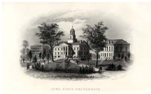
bottom left: A view of the "Iowa State University" campus in Iowa City—not Ames—from the 1870-71 General Catalog [General Catalogs Collection (RG 01.08)].